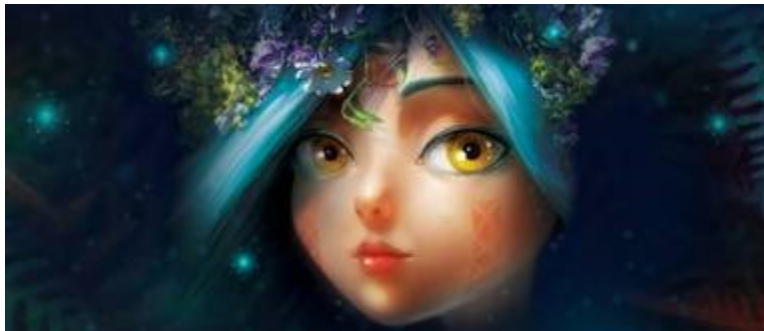
"MAVKA – The Forest Song" In Theatres 2019